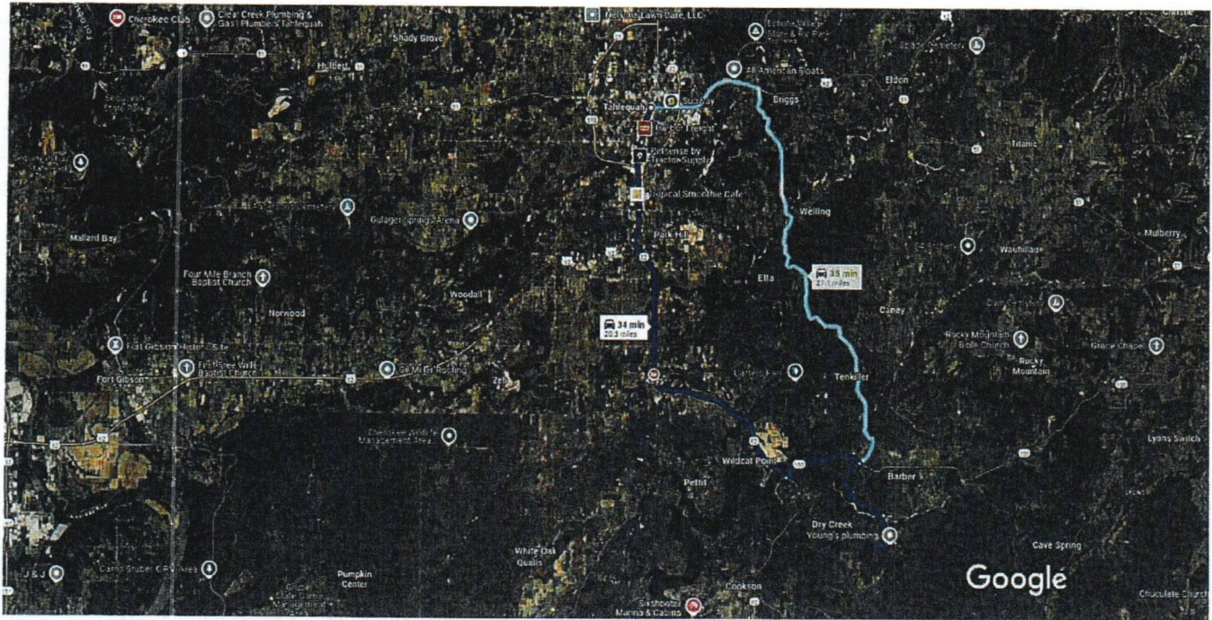
2 mi