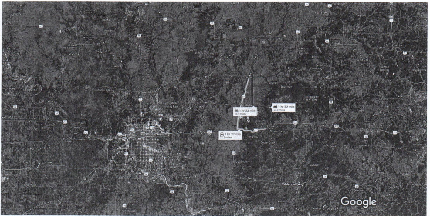
5 mi