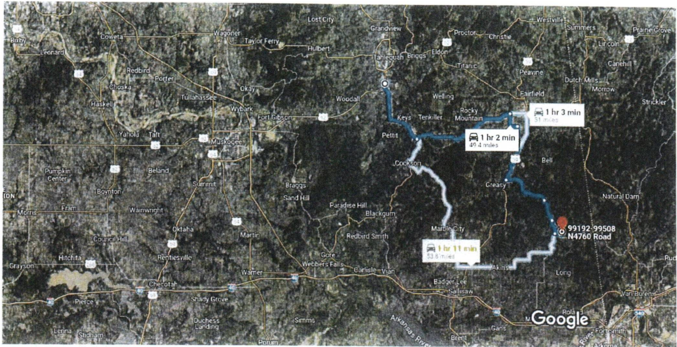
5 mi