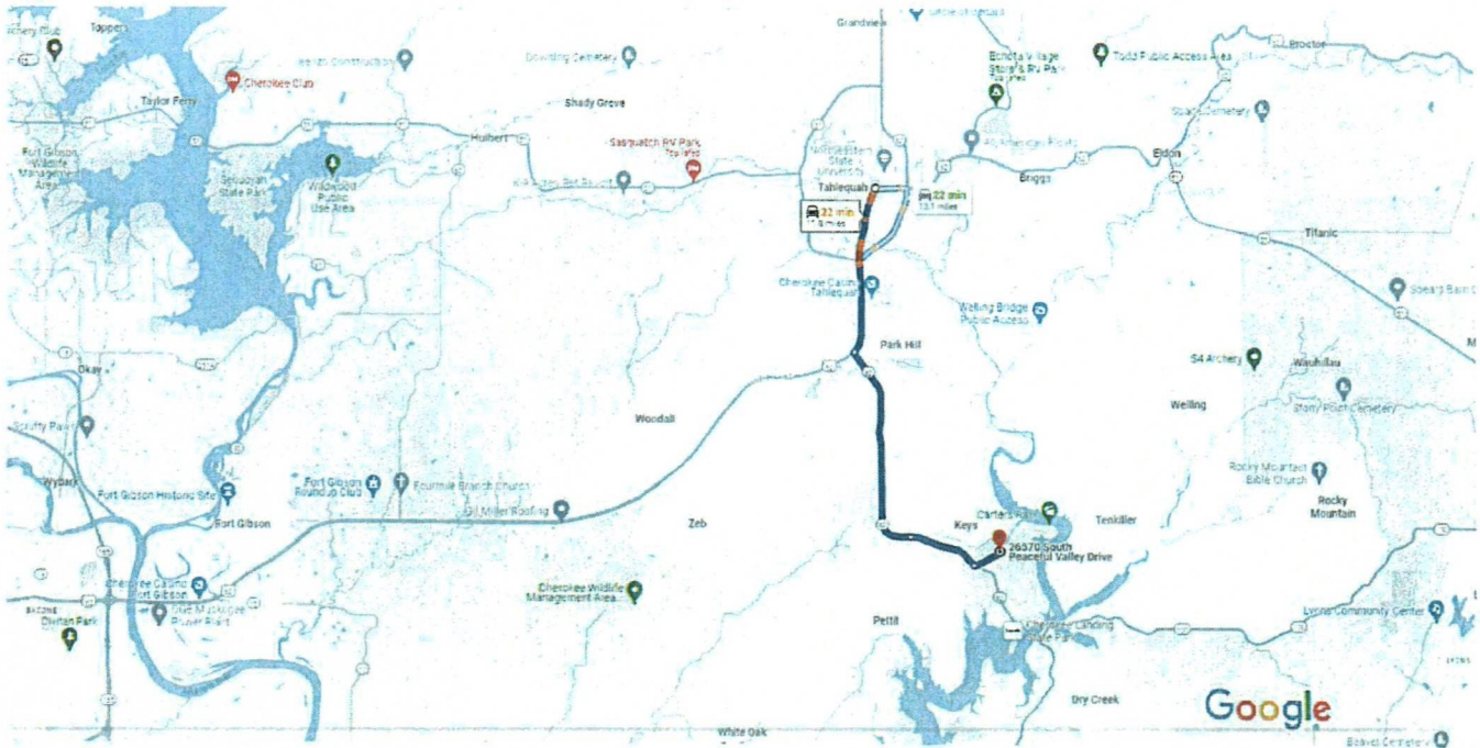
2 mi