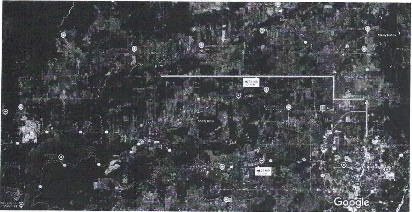
1 mi