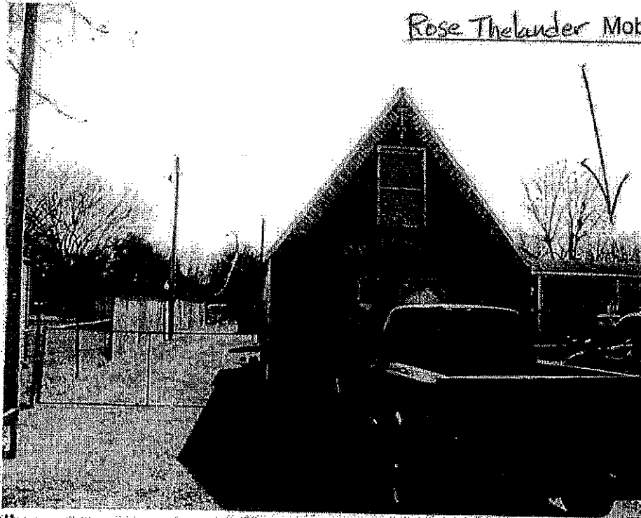
Rose Thelander Mobile Home

GPS Coordinates: N 36.26223' W 095.77156' Drive Time: 1hr 17min.