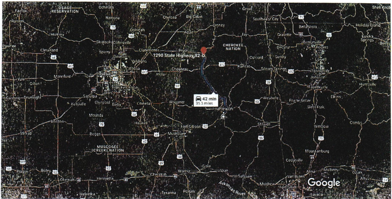
10 mi